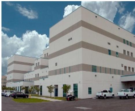
Pinellas County Jail medical complex

Contact: Liz Ernst lernst@acoustiblok.com 813.980.1400 Ext. 210